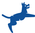
Dog Bites/ Animal Attacks