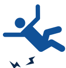
Slip & Fall